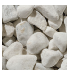
See Page 12