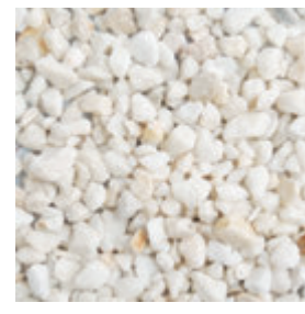
See Page 8