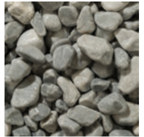
See Page 10