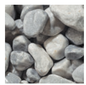
See Page 12