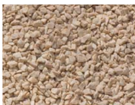
Beige Marble Marble tile off-cuts and rejects 1-3mm, 2-5mm