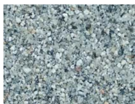
HM Quartz China clay residue 6-10mm