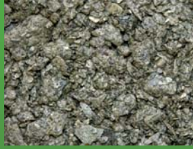
Green Slate Waste from roofing slate quarries 20 & 40mm