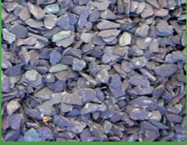
Blue Slate Waste from roofing slate quarries 20 & 40mm