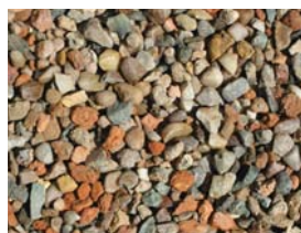
Eco-mix Selected demolition waste 2-5mm