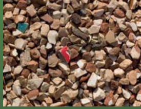
Cera-mix Tiling and sanitaryware waste 8-12mm