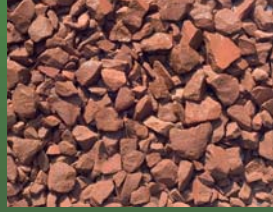
Terracotta Quarry tile rejects 5-14mm