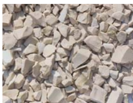
Ivory White Reject sanitaryware 6-10mm