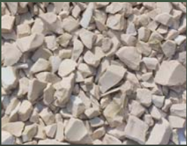
Ivory White Reject sanitaryware 8-16mm