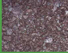
Plum Slate Waste from roofing slate quarries 20 & 40mm