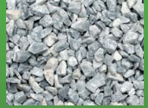
Ice Blue Marble tiling off-cuts and rejects 8-11mm