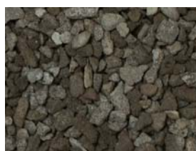
Steel Slag Specialised smelter slags 1-3mm, 2-5mm