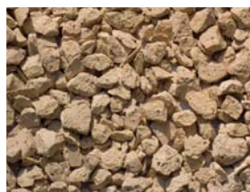
Buff Brick Brick rejects and seconds 1-3mm, 2-5mm, 6-10mm