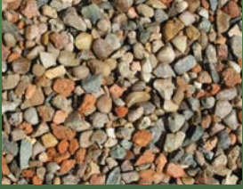
Eco-mix Selected demolition waste 5-8mm