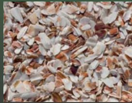
Scallop Shells Bi-product from shell fisheries 5-10mm