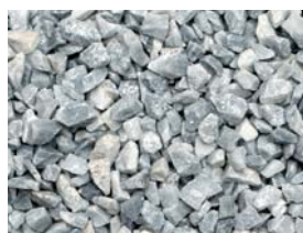
Ice Blue Marble tile off-cuts and rejects 2-5mm, 6-10mm