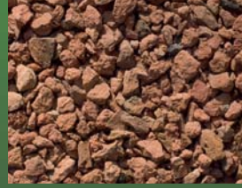
Red Brick Brick rejects and seconds 8-12mm