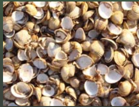
Cockle Shells Bi-product from shell fisheries c20mm