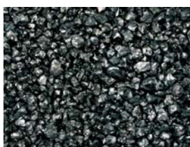
Copper Slag Specialised smelter slags 1-2mm