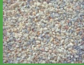
Flamingo Marble tiling off-cuts and rejects 8-14mm, 14-20mm