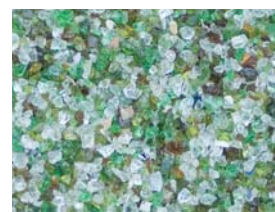
Eco-glass Recycled glass cullet 1-3mm, 2-5mm