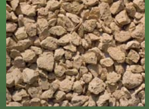
Buff Brick Brick rejects and seconds 8-12mm