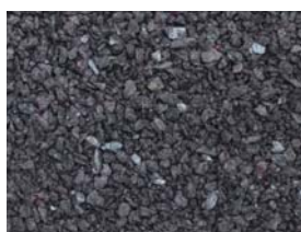
Dark Ruby Specialised smelter slags 1-3mm